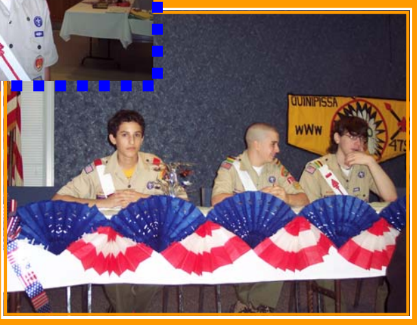
The 2005 Quinipissa Lodge Officers... or at least 3 of them.