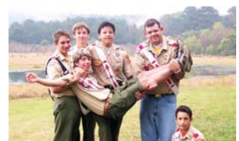
Teamwork of 2004 Officers Training held during November